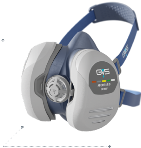
H: 130 mm D: 117 mm W: 195 mm

Weight Mask + Filters: S/M 320 g, M/L 327 g Filters: 236 g